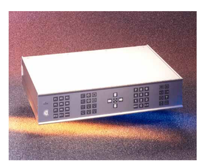
The Matrix System 1000M