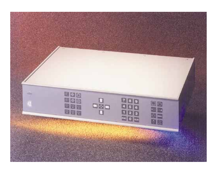
The Matrix System 500M

Ernitec SYSTEM 1000M is an advanced Video, Control and Alarm handling System to be used in CCTV applications either as a large stand alone system or as part of a larger surveillance installation with decentralised remote sites.